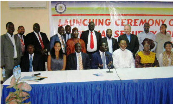
Members of the ASSN Executive Committee with South Sudan's Minister for National Security, General Oyay Deng Ajak (centre, with microphone before him) and other South Sudanese Government officials.

On the morning of 17 September 2012, members of the ASSN Executive Committee attended the launch of South Sudan's National Security Policy (NSP) Development Process in Juba, South Sudan.