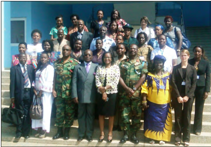
A group photo of participants at the stakeholders' forum on gender mainstreaming in Accra, Ghana.

A stakeholders' forum on The Impact of and Persisting Challenges to Effective Gender Mainstreaming in African Security Institutions was held on 2-3 October at the Kofi Annan International Peacekeeping Training Centre (KAIPTC) in Accra, Ghana.