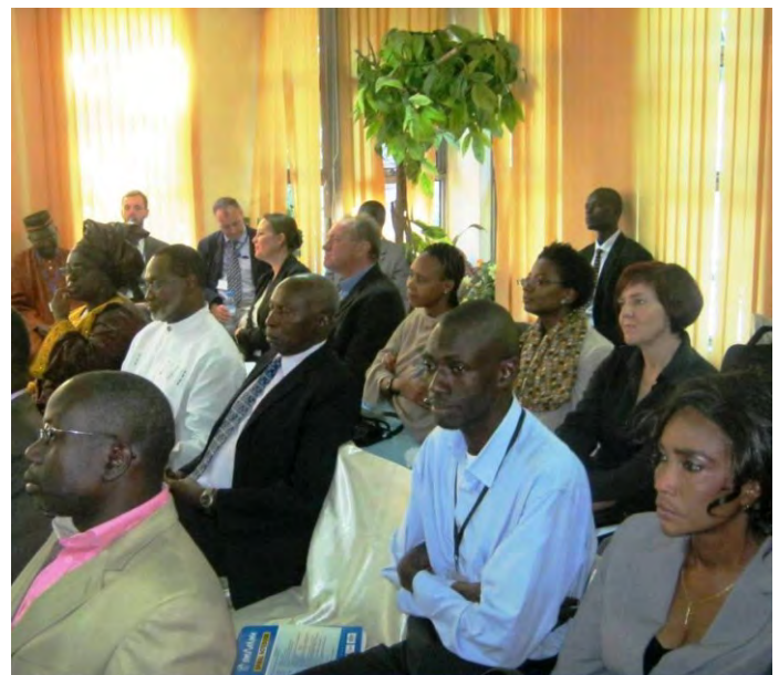
A section of attendees at the launch ceremony, among them members of the ASSN Executive Committee.

On 16 -18 September 2012, the African Security Sector Network (ASSN) also held a meeting of its Executive Committee at the Aron Hotel in Juba. The three-day meeting of the ASSN ExCo was hosted by the CPRD, which is the ASSN's regional hub for the Horn of Africa.