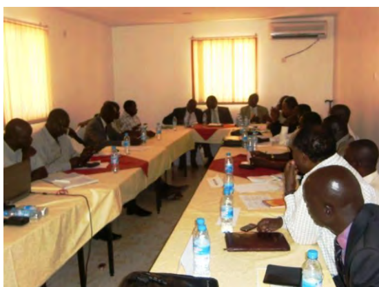
Feature Photos: Members of South Sudan National Security Policy (NSP) drafting committee at their induction course conducted in Juba by the AIG.