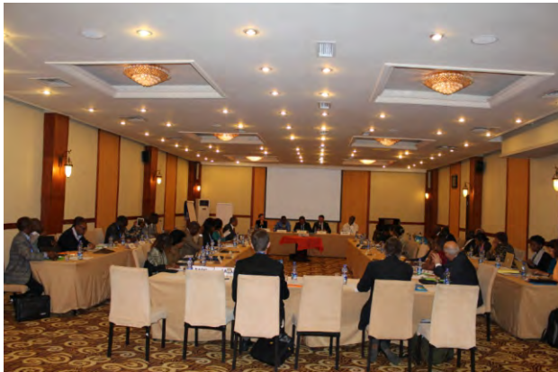
Participants at the November 2013 consultation workshop, held in Addis Ababa to validate the first three OGNs. The ASSN has recruited a group of consultants for the second batch of OGNs, which will be used in the operationalisation of the AU Policy Framework on SSR.

The African Security Sector Network (ASSN) has selected consultants to draft a second round of Operational Guidance Notes (OGNs) for the African Union Policy Framework on Security Sector Reform (AUPFSSR).