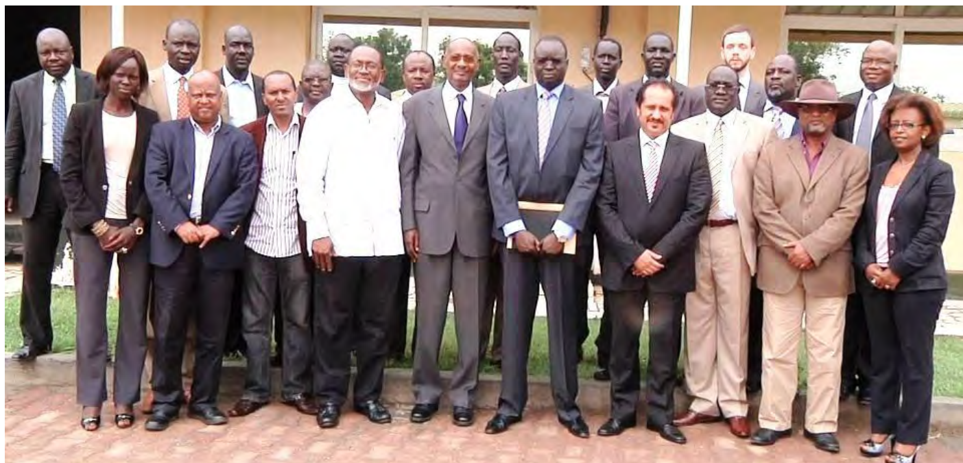
Participants pose for a group photo during the consultative meeting in Juba, South Sudan.

The meeting ended with closing remarks from South Sudan's Deputy Minister for Defence, Dr. Majak D'Agot.