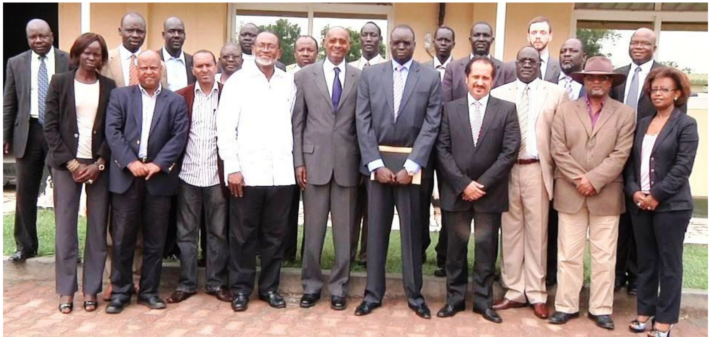
Participants pose for a group photo during the consultative meeting in Juba, South Sudan.

The meeting ended with closing remarks from South Sudan's Deputy Minister for Defence, Dr. Majak D'Agot.